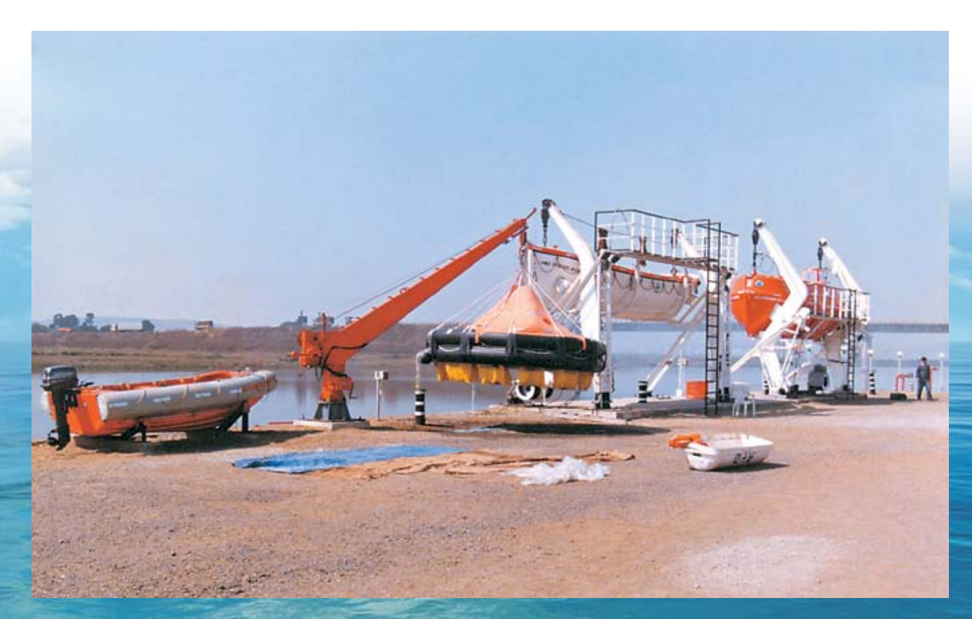
Seaside view of Jetty, Panvel Complex