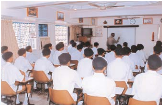
BPMA - View of Class Room