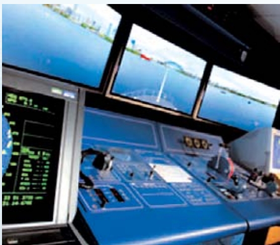
Simulation – South Tyneside College

South Tyneside College is the only college in the UK to gain National Nautical Centre of Excellence status from the UK Government, in recognition of the excellent quality of its marine and nautical training.