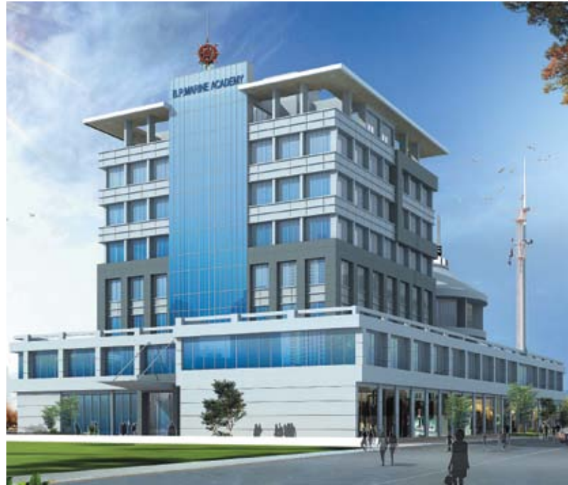
B. P. Marine Academy at Belapur Campus