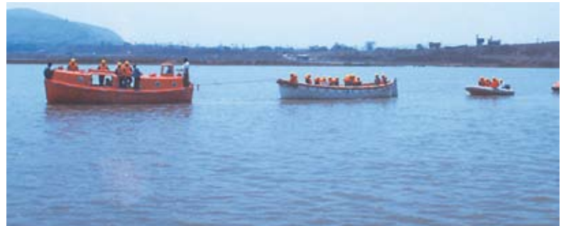
BPMA Cadets participating in marshalling of boats