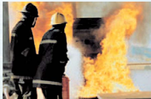
Firefighting – South Tyneside College