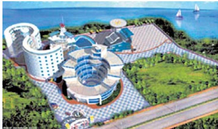
B.P.M.A. Panvel campus, Phase-I