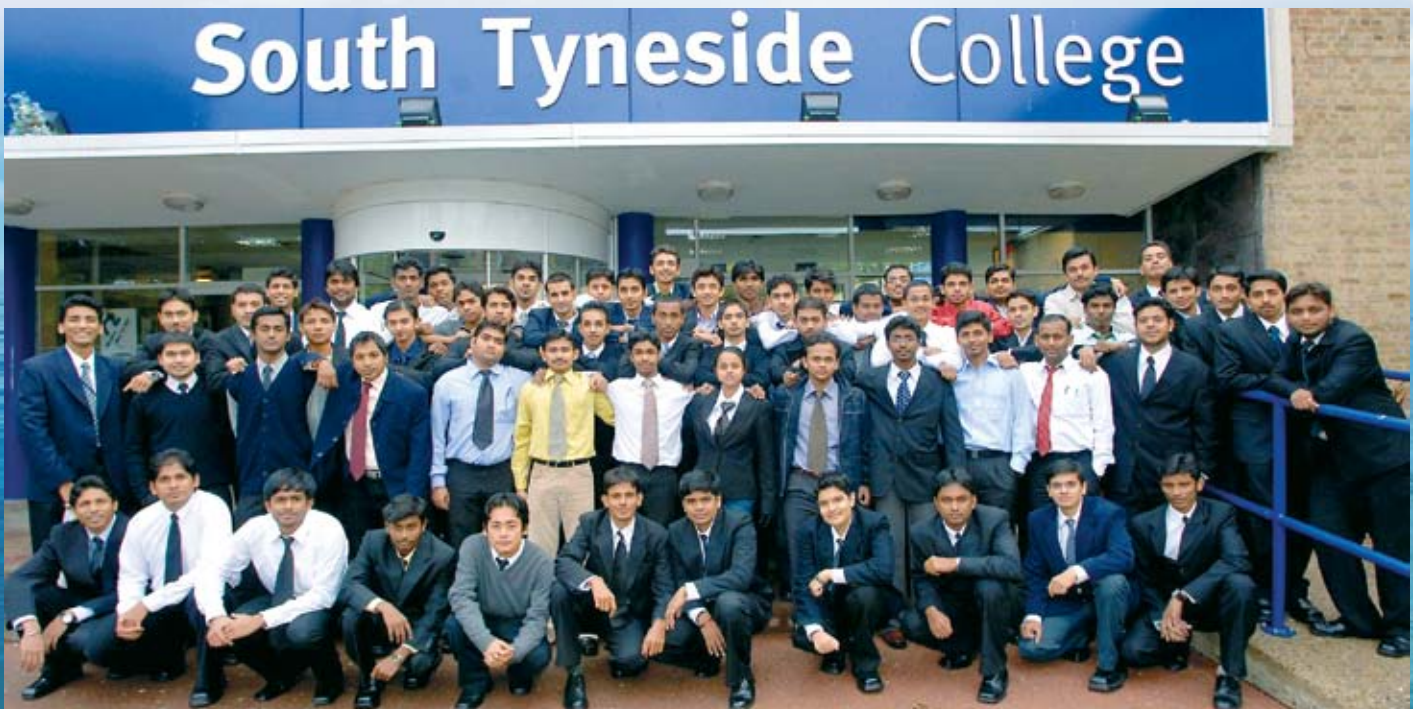
B.P. Marine Academy 1 st batch of H.N.D. Nautical Science Students at South Tyneside College (U.K.) during their 2 nd year of the programme