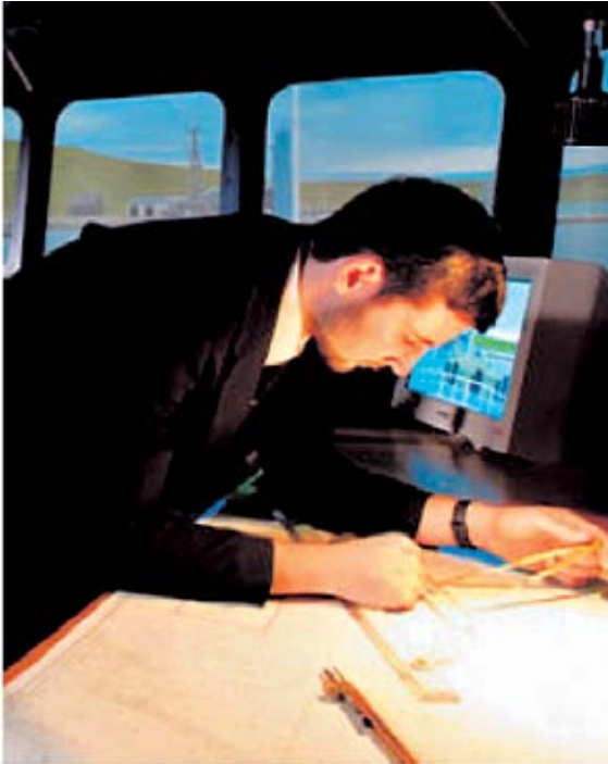
Navigation – South Tyneside College