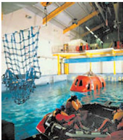
Environment - South Tyneside College