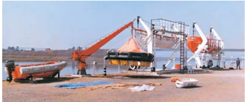
BPMA Life Boat Jetty