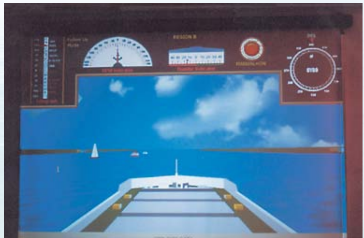
Steering Simulator with LCD Projection Facility at BPMA