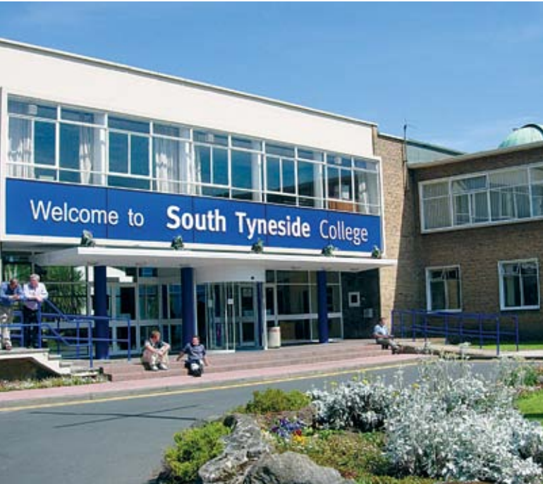
South Tyneside College

SOUTH TYNESIDE COLLEGE & B. P. MARINE ACADEMY