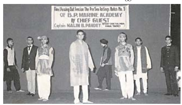
A still from the Fashion Show presented by the cadets

"I would rate most of the BP Marine ratings as comparable or may be better than some of the officers of the Merchant Navy."